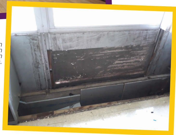
(Right) Ventilators in rooms have been removed to make room for new univents.

The First Day of School is Tuesday, August 20!